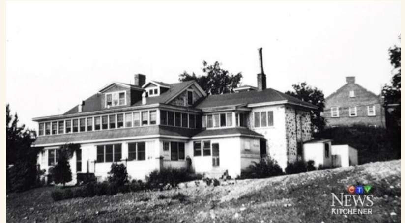
Campus of Freeport Military Hospital