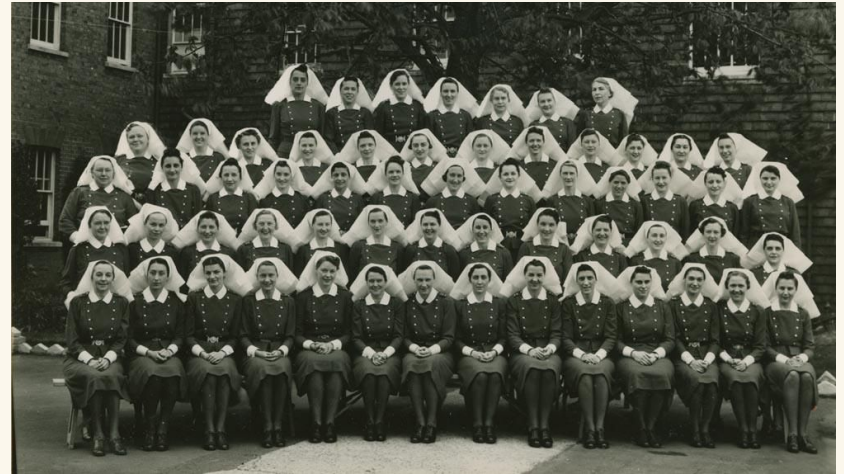
CAMC Nursing Sisters photographed